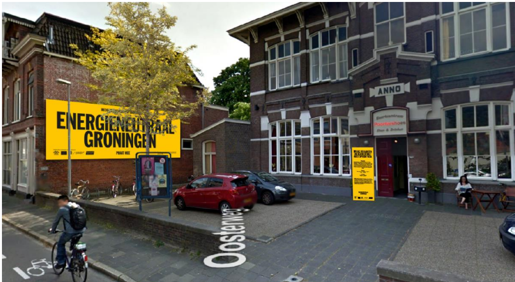
Poorterhoes in the Oosterpoort neighbourhood.