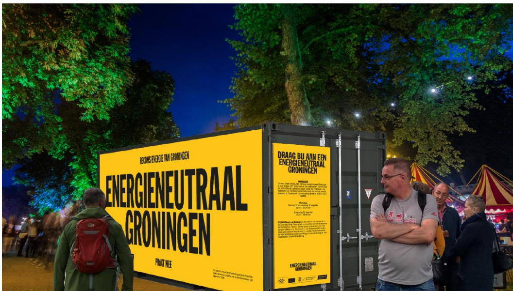
The RECOMS container at the Noorderzon Festival